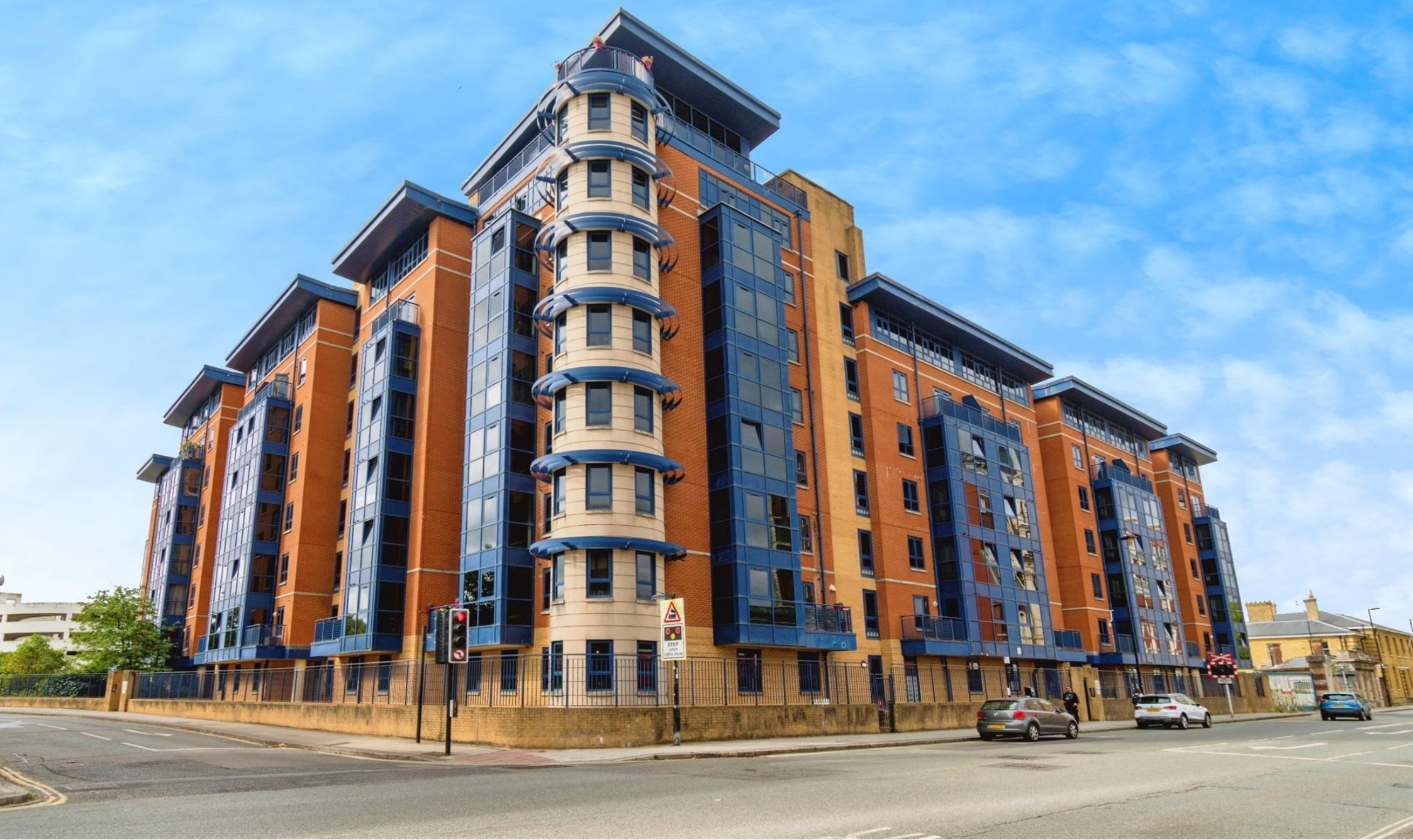
Charter House, Canute Road, Southampton SO14 3FZ