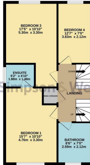
1ST FLOOR 587 sq.ft. (54.5 sq.m.) approx.