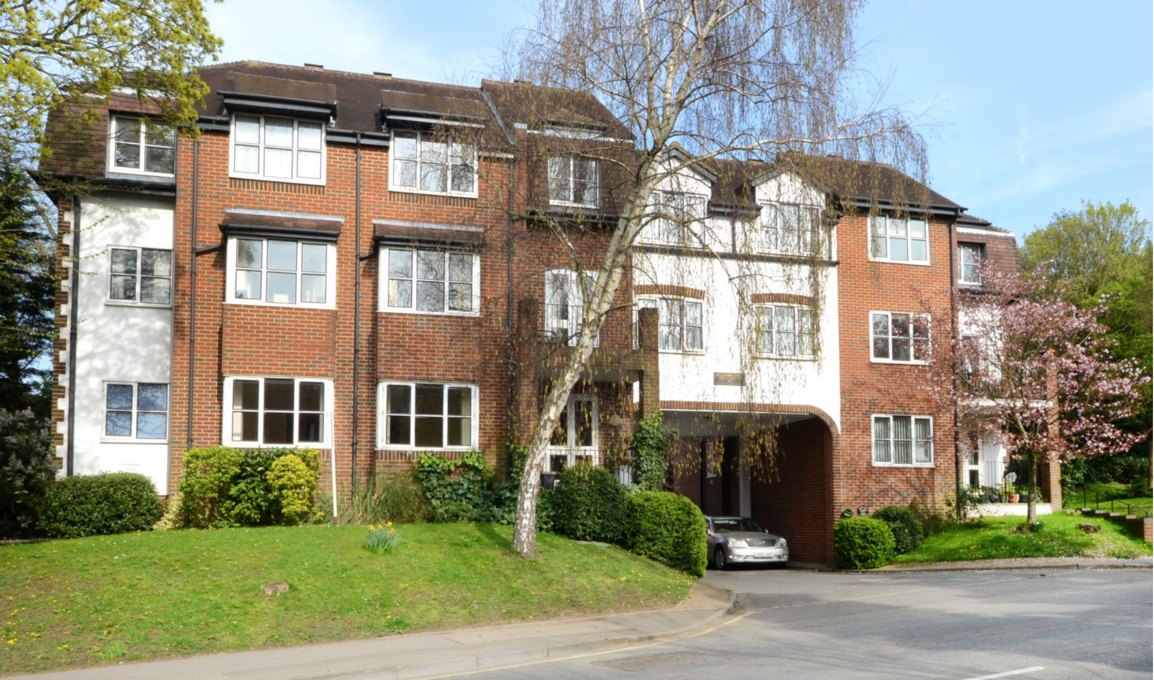
Alexandra Lodge, Monument Hill, KT13 8RY riceandroman.co.uk