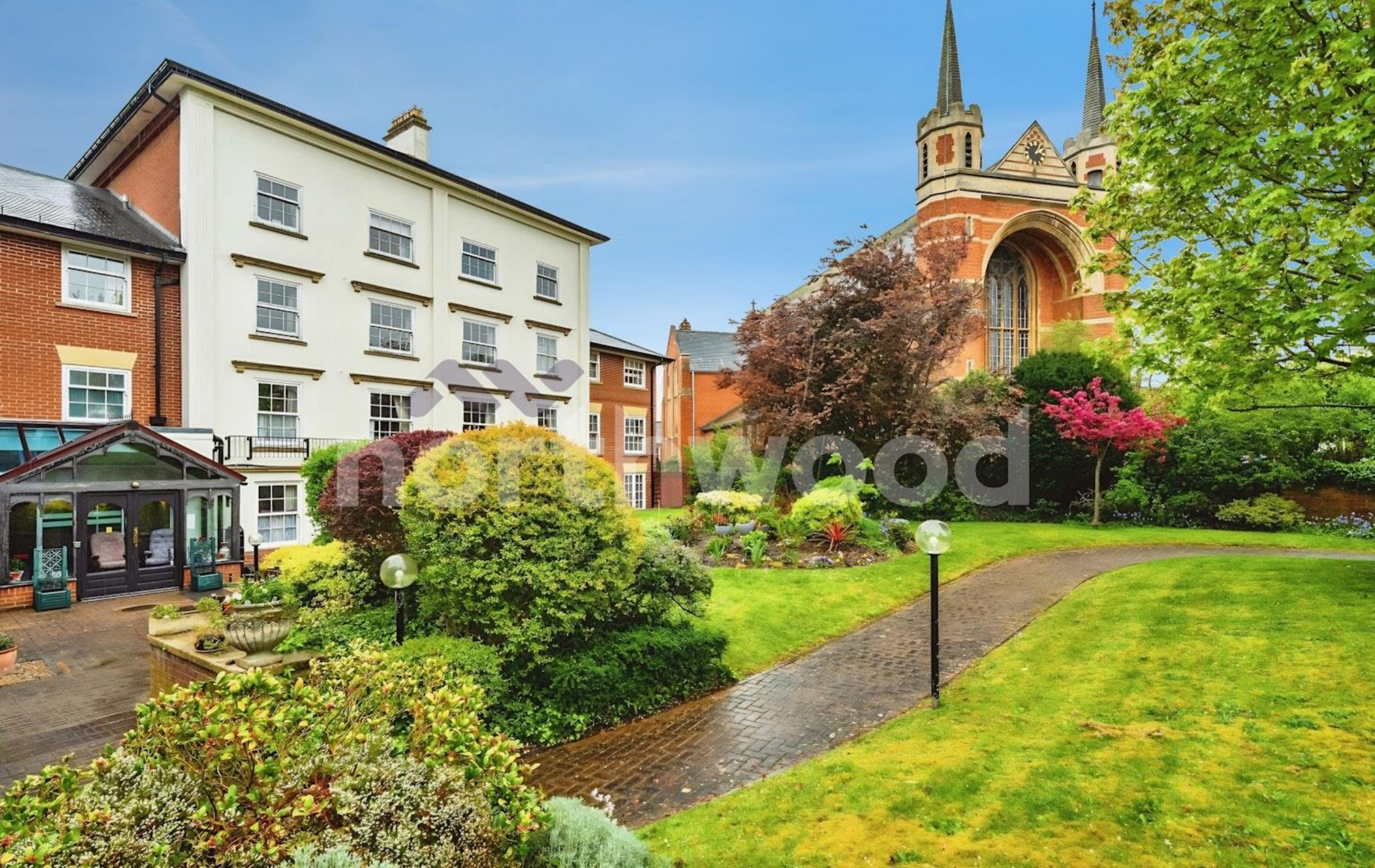
Homenash House St Georges Lane North, Worcester