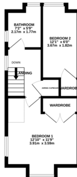
TOTAL FLOOR AREA - 607 sq ft (56.4 sq.m.) approx.

While every attempt has been made to ensure the accuracy of the description contained here, measurements of areas, volumes, rooms and any other items are approximate and no responsibility is taken for any error, omission or misstatement. This plan is for illustrative purposes only and should be used in conjunction with the prospective purchaser. The services, fixtures and appliances shown may not be fitted and no guarantee is given to their quantity or efficiency can be given.