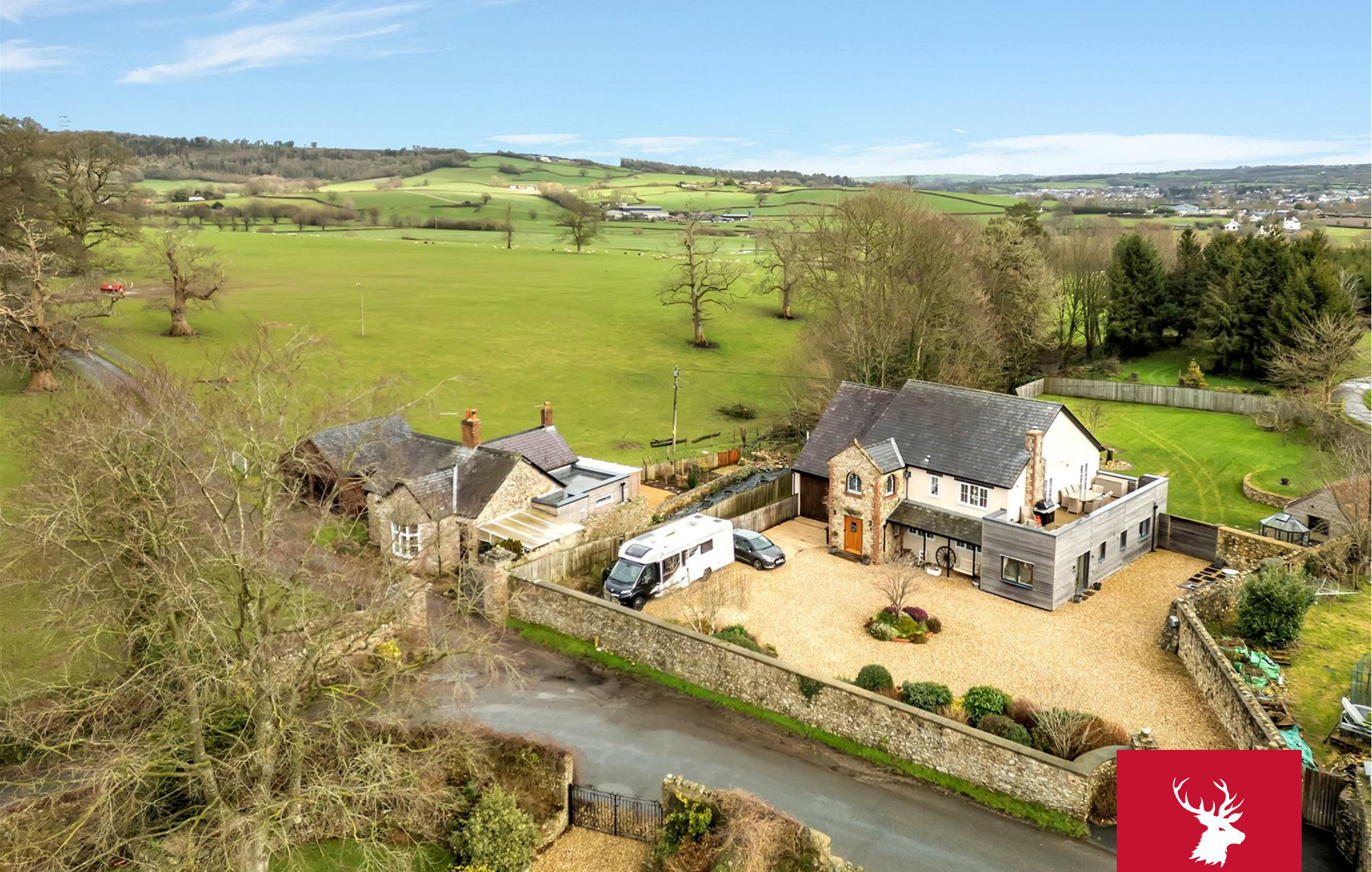
Old Vealhayes Yard