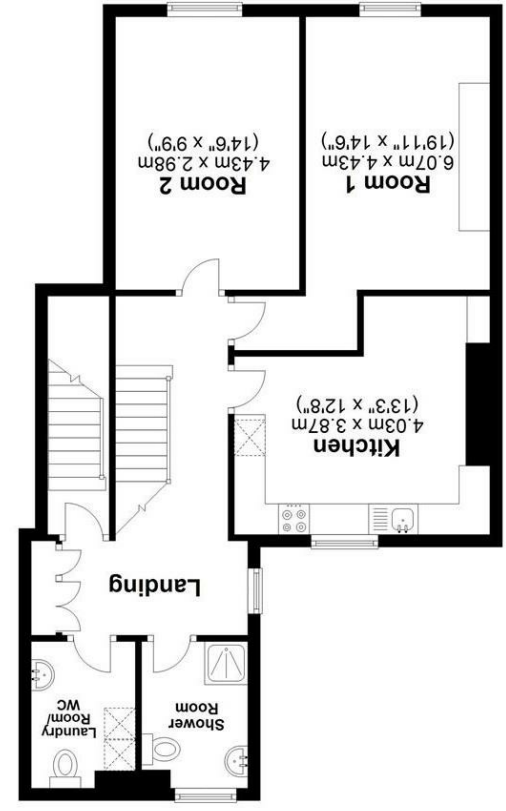
Approx. 69.6 sq. metres (749.5 sq. feet)