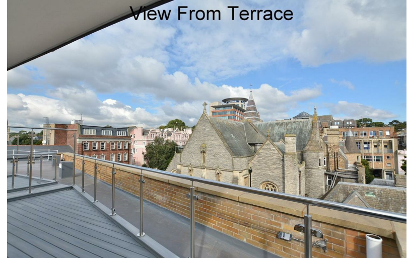
View From Terrace

Agents note: Please be advised that there is no allocated parking with this apartment. Parking permits are available at further cost in the local car parks surrounding the property.