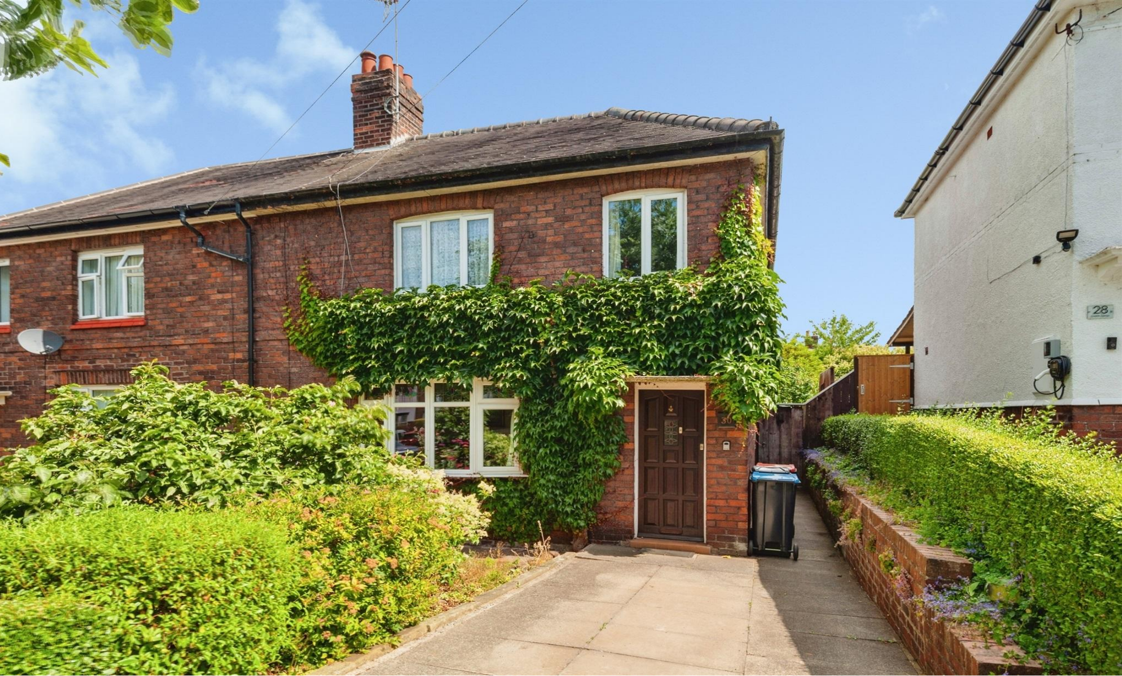
Park Lane, Frodsham WA6 6RY