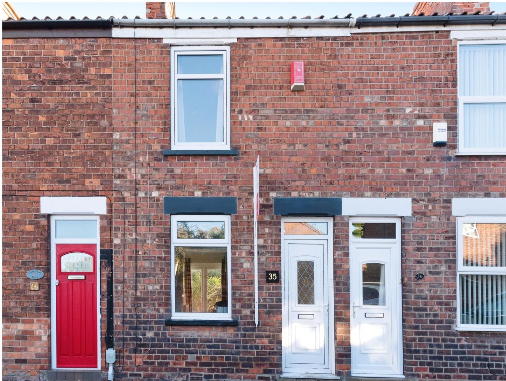
Trinity Grove, Grovehill Road, BEVERLEY, HU17 0EB