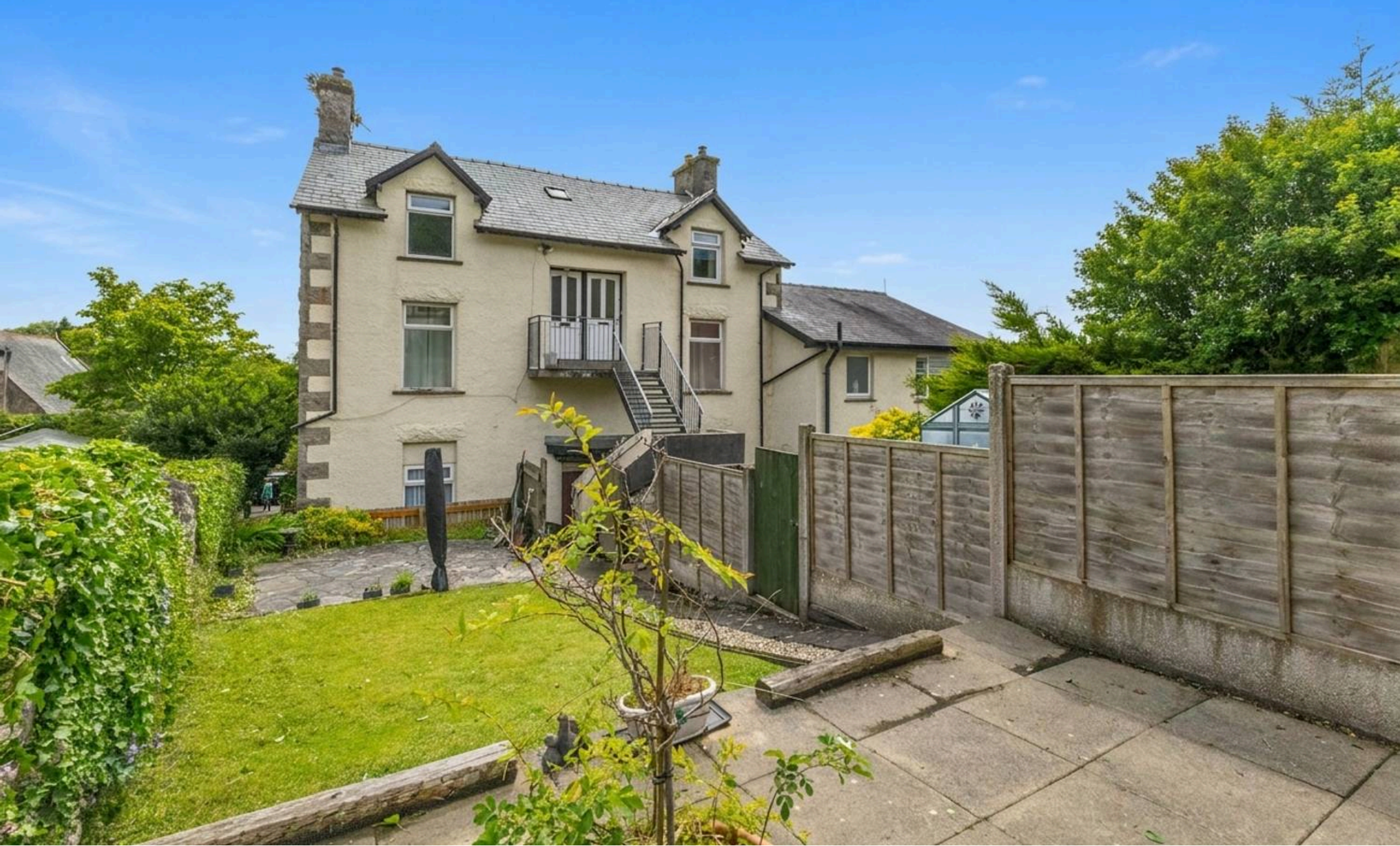
3 East View Kents Bank Road, Grange-Over-Sands £135,000