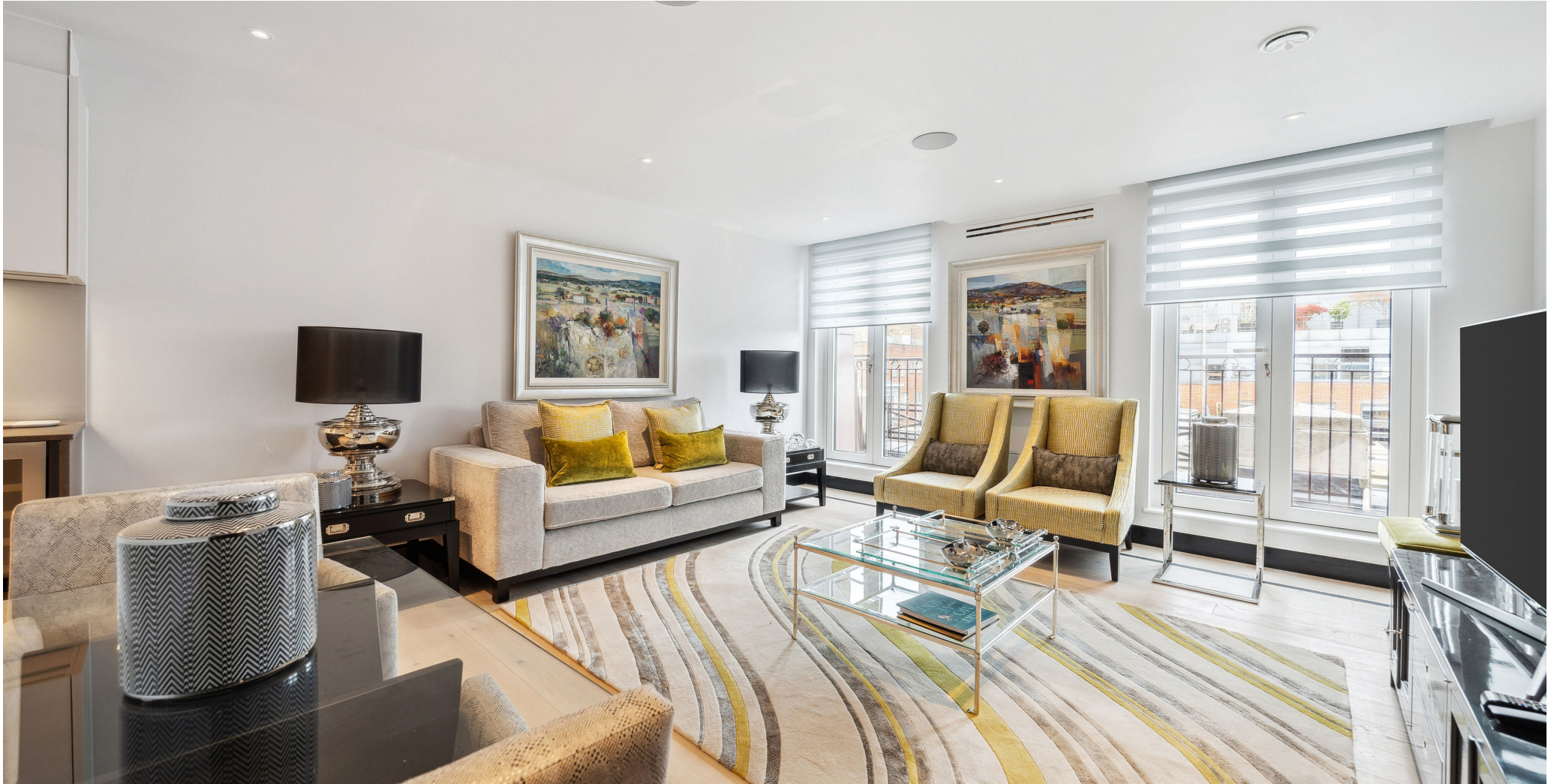
CHAPTER STREET, Westminster SW1P