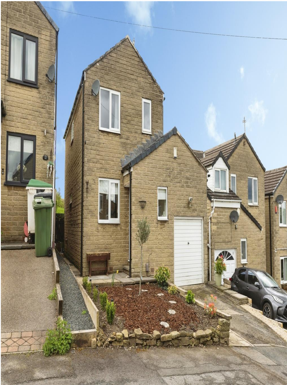
South Street, Oakenshaw Bradford BD12 7DJ