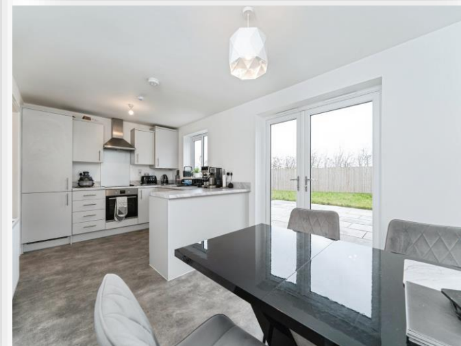
Barley Close, Chatteris PE16 6FZ