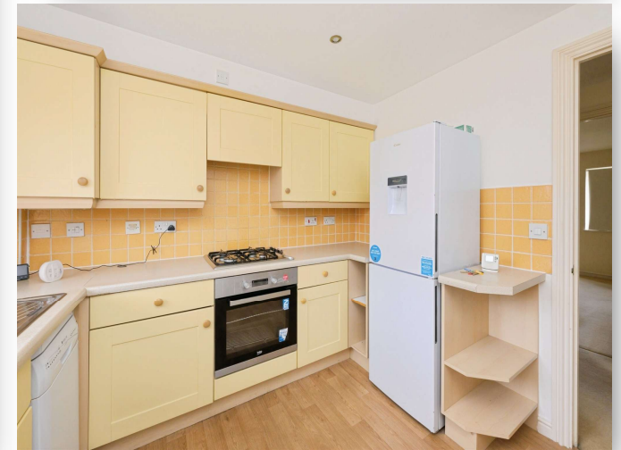
Mill Brook Court Collett Road, Ware SG12 7JN