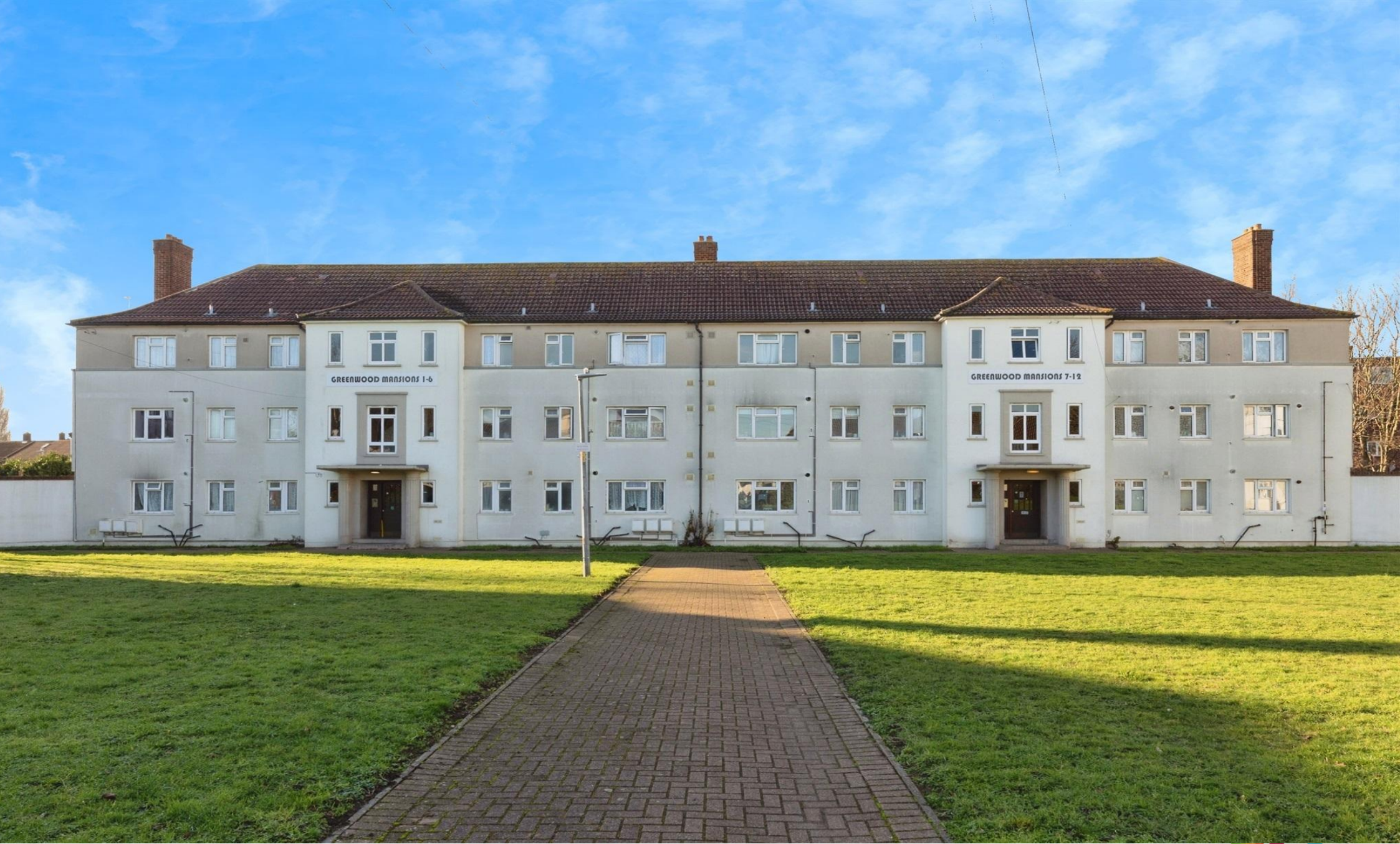
Greenwood Mansions, Lansbury Avenue, Barking, IG11 9NJ