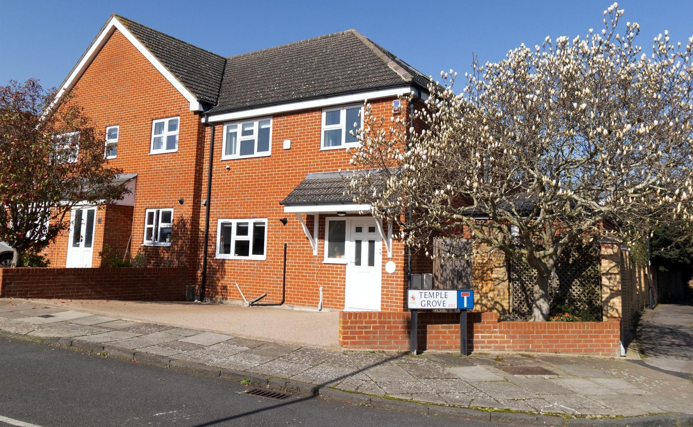
Temple Grove, Enfield, EN2 8EH