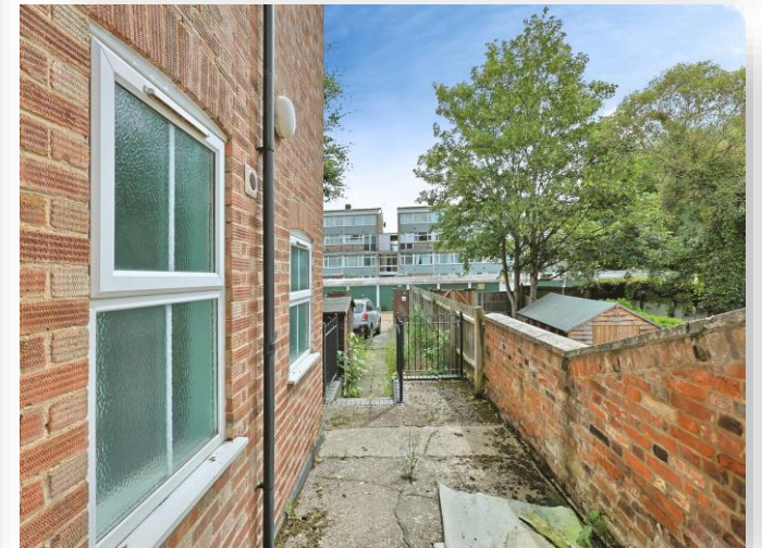
Old Palace Road, Norwich, NR2 4JF