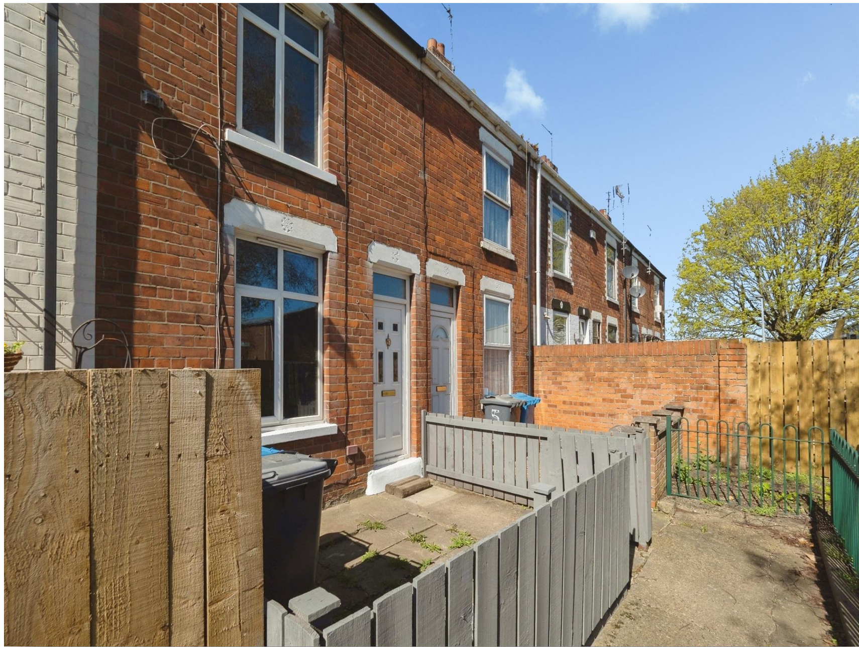
Nelson Villas, Hull, HU8 7HY