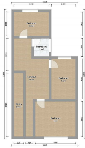
Warwards Lane First Floor