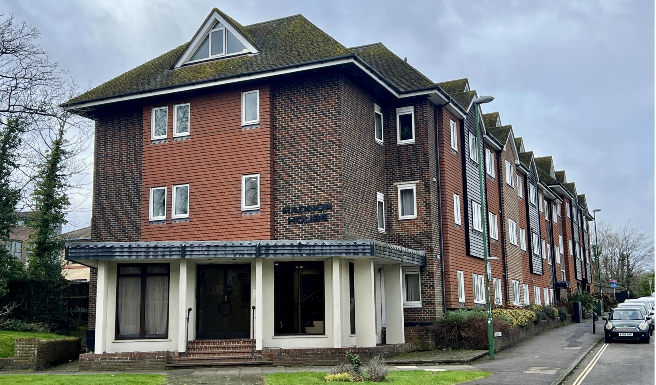
23 Radnor House Harlands Road, Haywards Heath, RH16 1LN