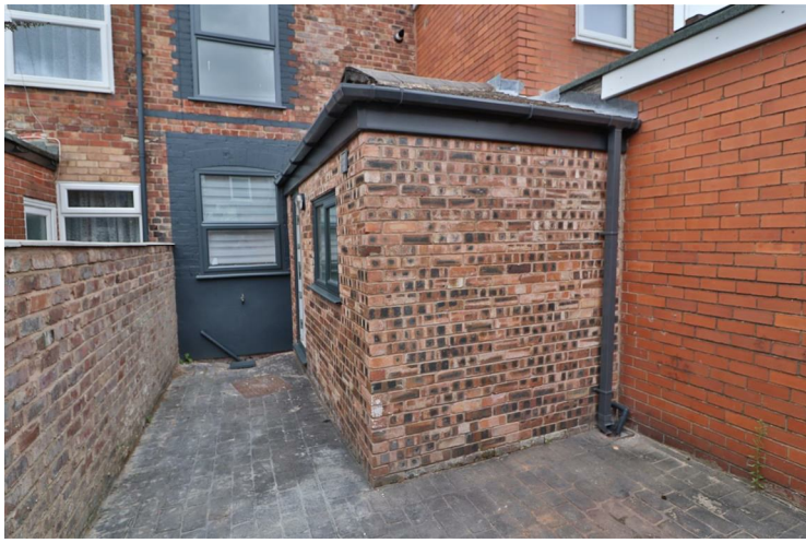
Externally there is an enclosed rear yard with gate access.