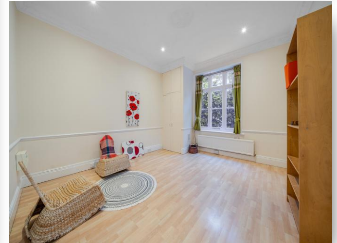
Flat 2 Ray House, Ray Park Road, Maidenhead SL6 8QX