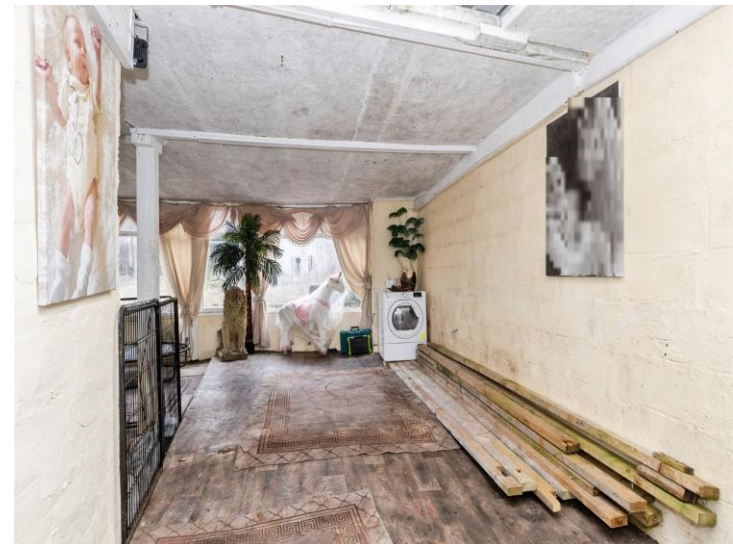
Bellevue Close, Princetown Yelverton PL20 6RT