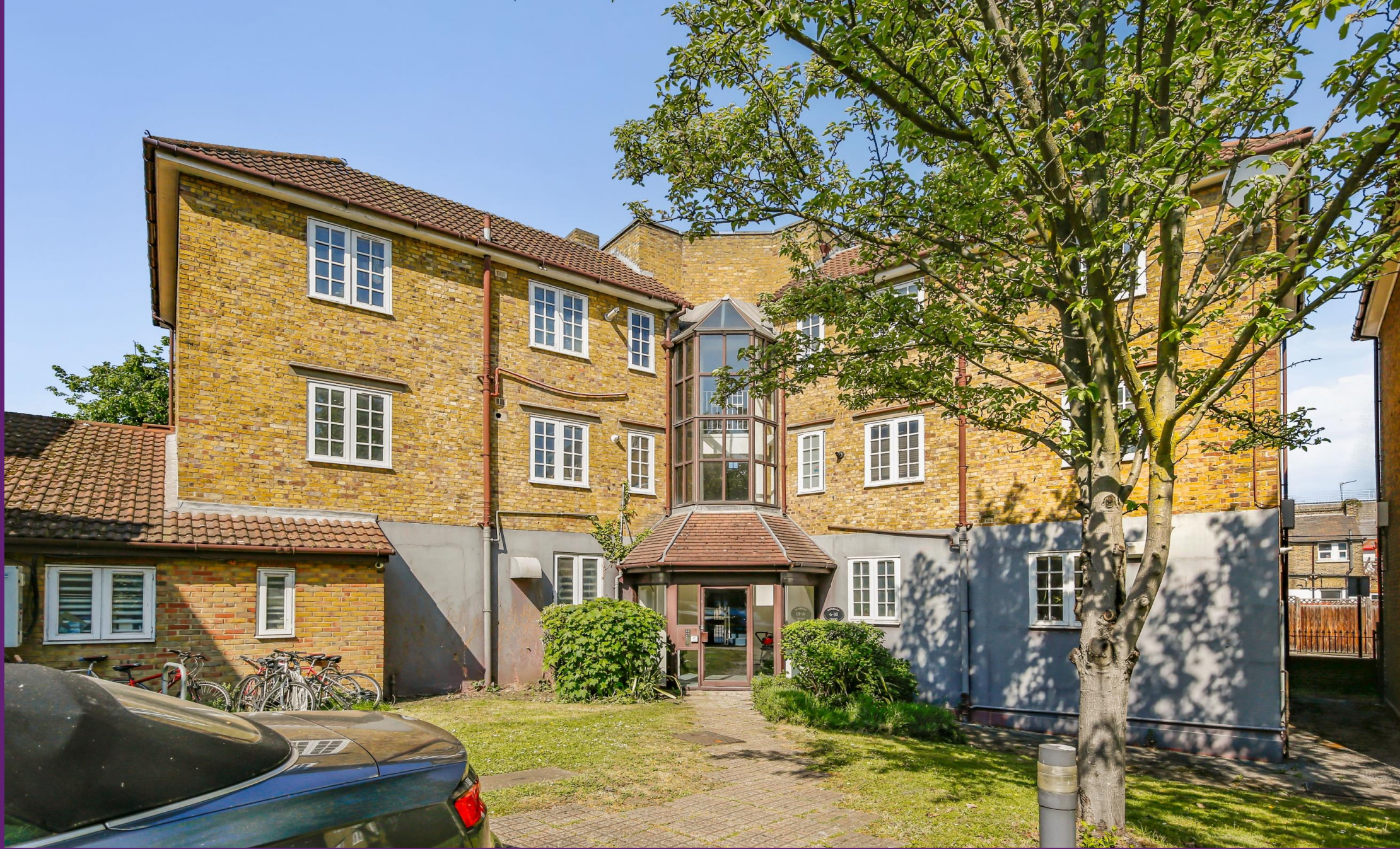
Vauxhall Court Frogmore, SW18