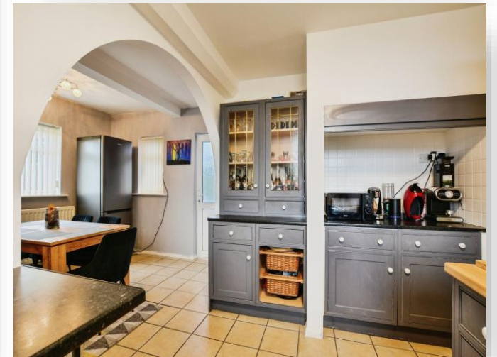
Lincoln Green, SKEGNESS PE25 2PT