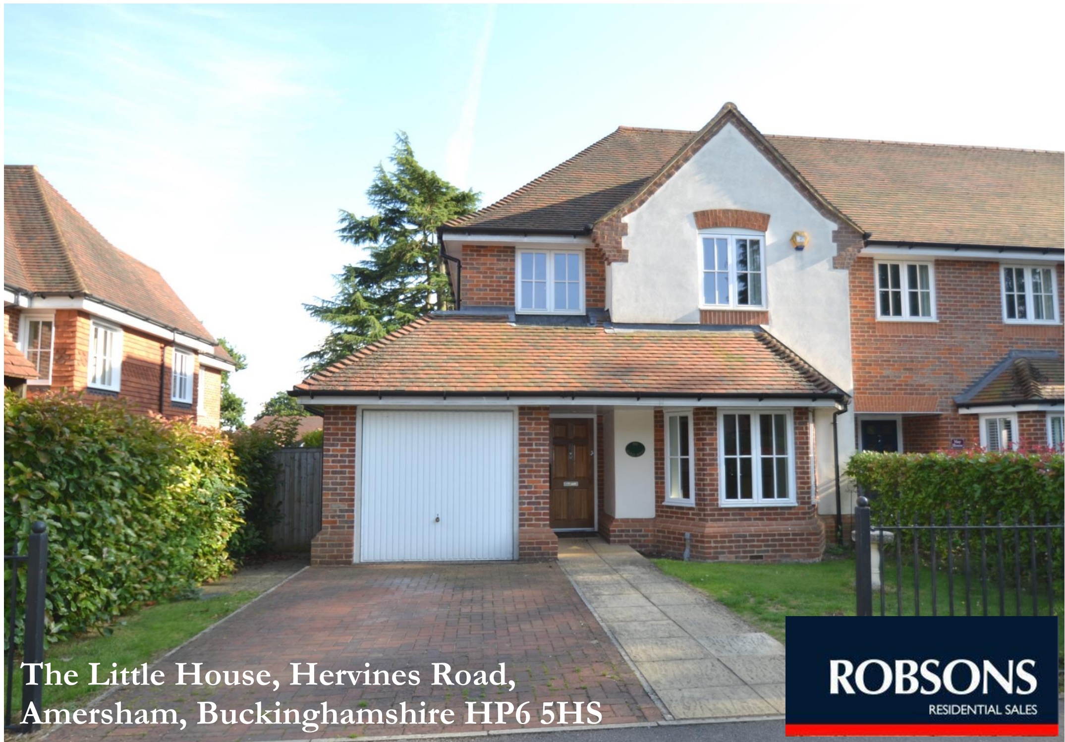
The Little House, Hervines Road, Amersham, Buckinghamshire HP6 5HS