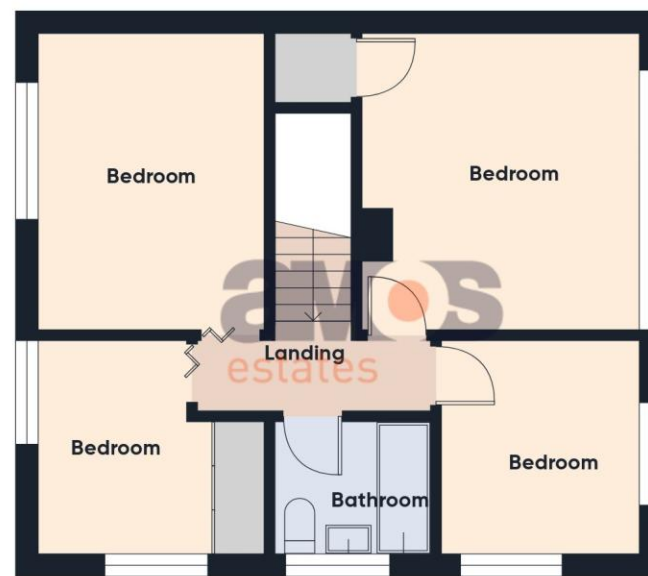
First Floor Building 1