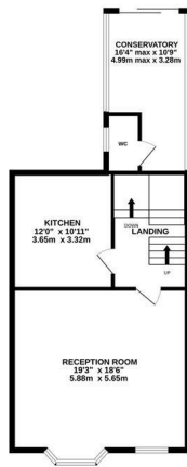
1ST FLOOR 636 sq.ft. (58.9 sq.m.) approx.