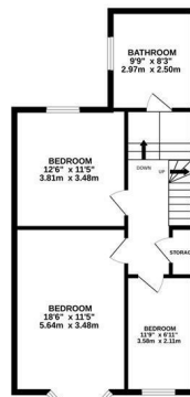
2ND FLOOR 588 sq.ft. (54.2 sq.m.) approx.