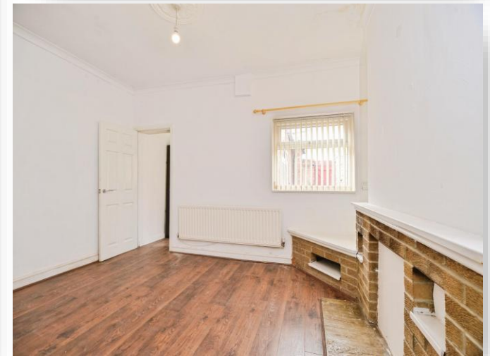
Suffolk Street, Stockton-On-Tees TS18 4BA