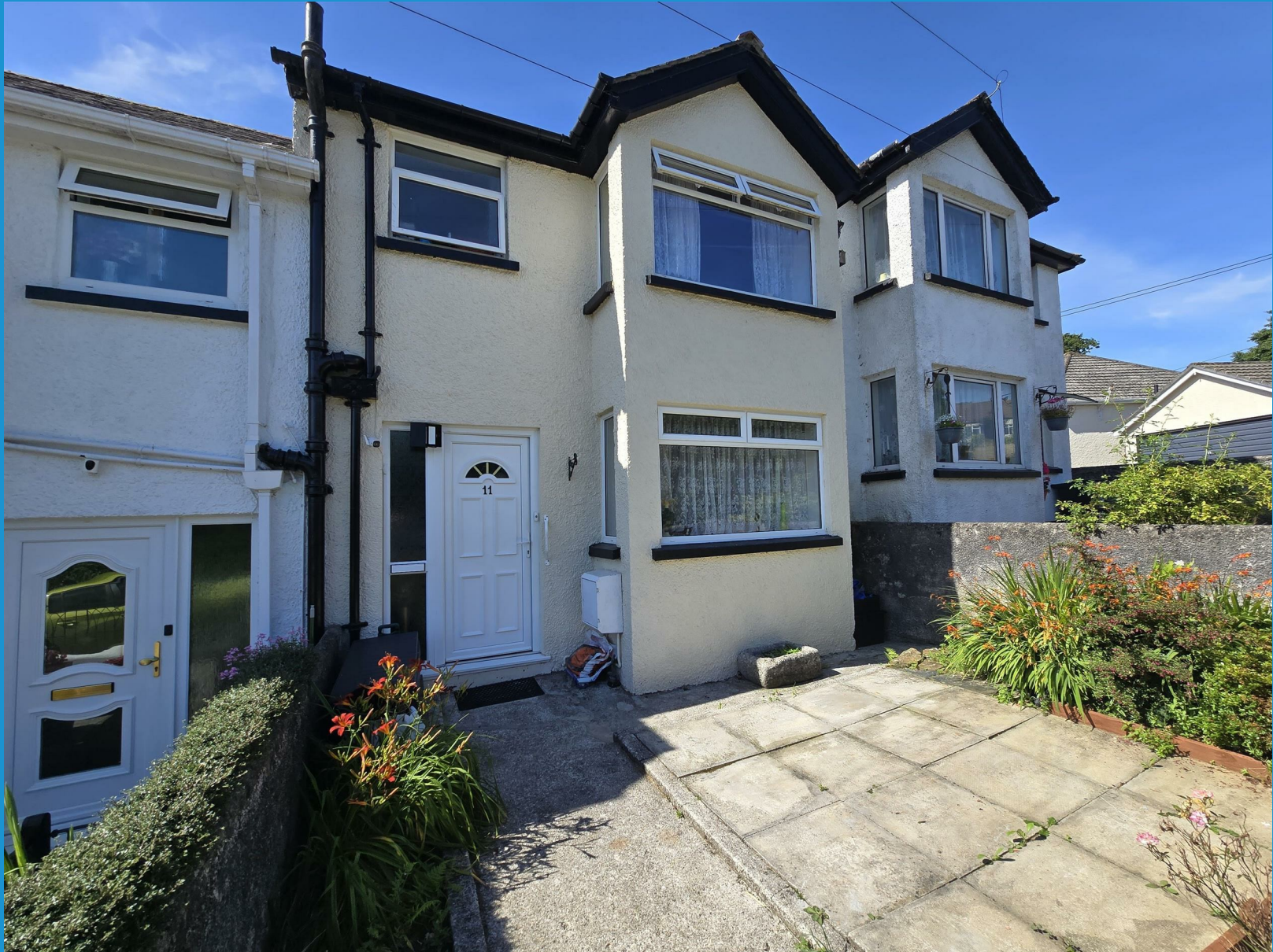
11 Ranch View Launceston | Cornwall