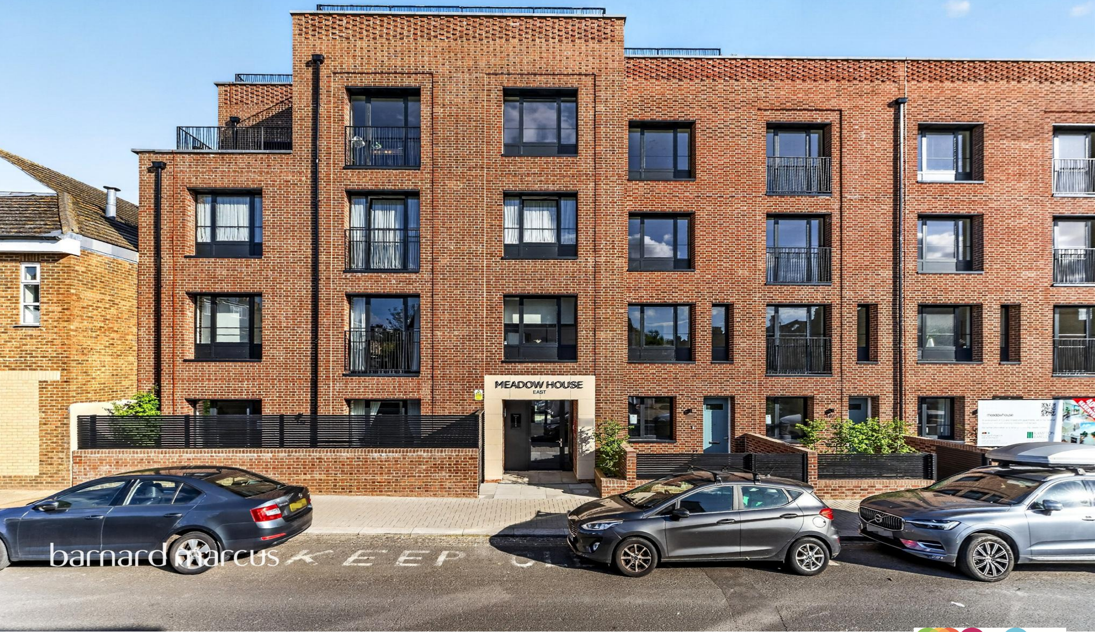
Meadow House, Fallsbrook Road, London SW16 6DY