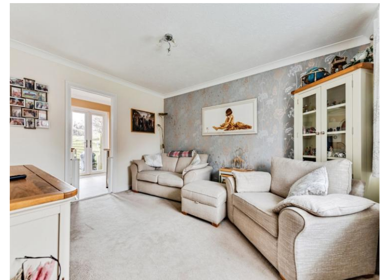
Midwinter Avenue, Milton, Abingdon, OX14 4XB