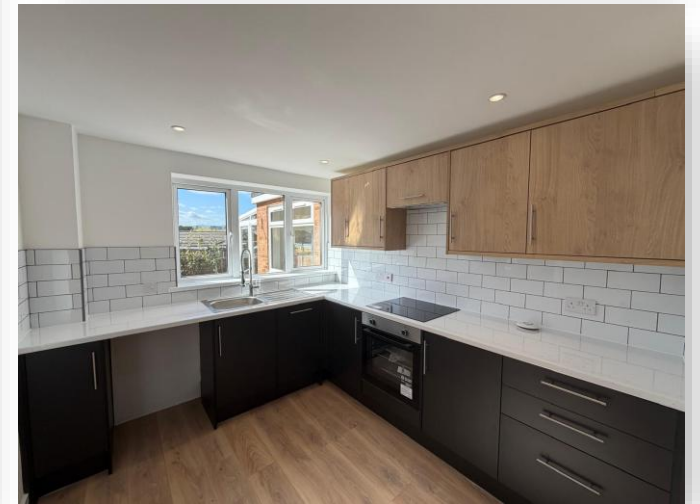
Rockingham Road, Kettering NN16 9JD