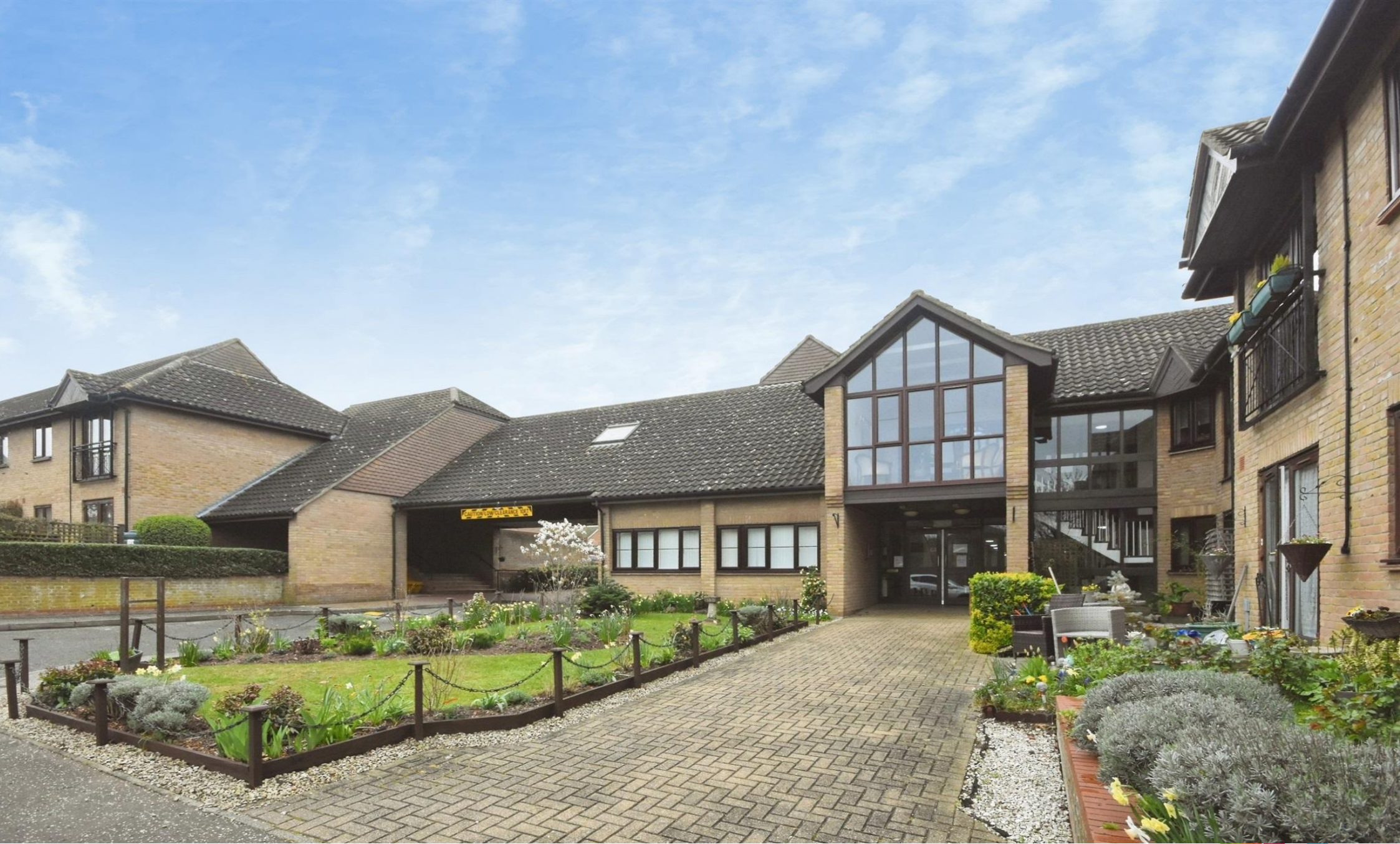
Kingfisher Lodge, Great Baddow CHELMSFORD CM2 7JZ