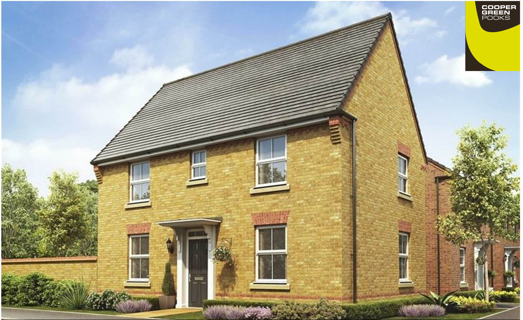
Plot 84, The Hadley, Rose Place, Welshpool Road, Bicton Heath, Shrewsbury, SY3 5BU £400,000