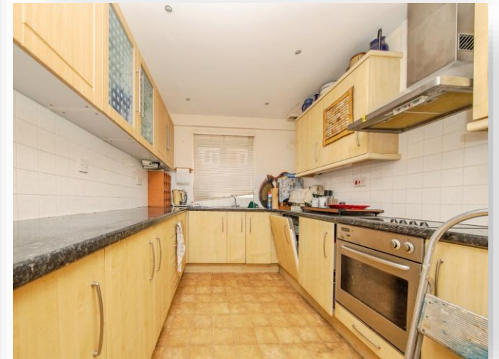
Neptune Square, Ipswich, IP4 1QH