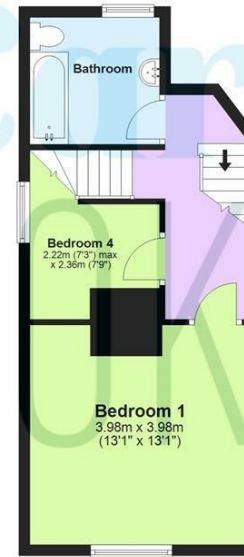
First Floor Approx. 35.7 sq. metres (384.8 sq. feet)