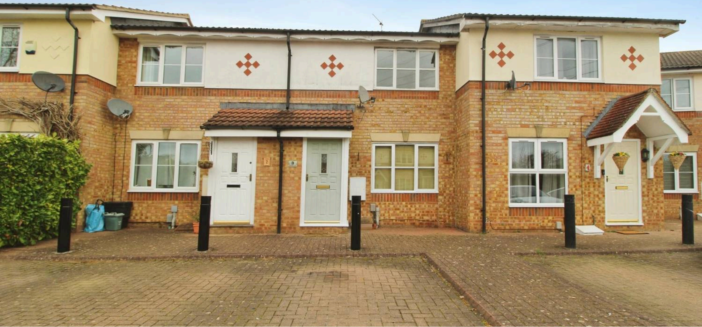
3 Graythwaite Close, Swindon Swindon