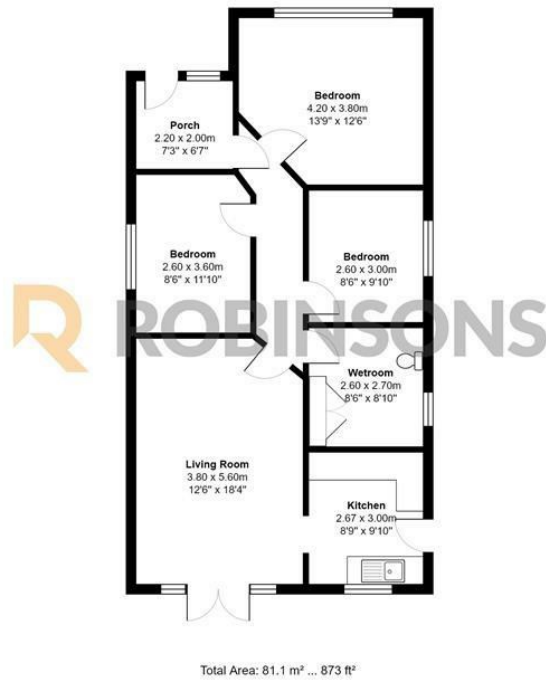
Floorplan produced by Woodside Photography Floorplan is for illustration purposes only and all measurements are approximate