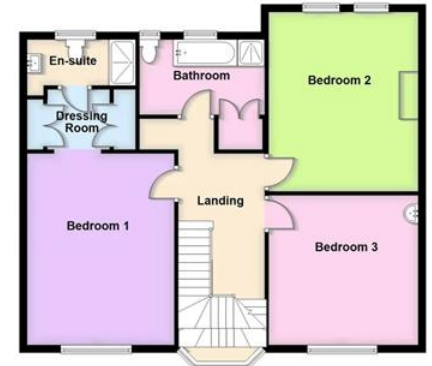
First Floor Approx. 86.4 sq. metres (929.6 sq. feet)