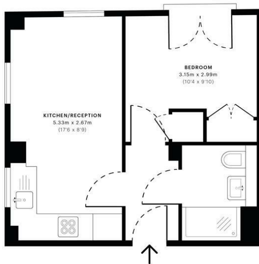
— First Floor

GROSS INTERNAL AREA (GIA) The footprint of the property 31.68 sqm / 341.00 sqft