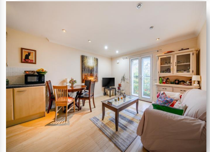
Flat 13 Delta Court, Grenfell Road, Maidenhead SL6 1ES