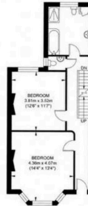
Ground Floor Approximate Floor Area 557.46 sq ft (51.79 sq m)