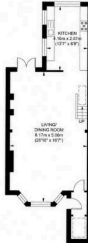
Lower Ground Floor Approximate Floor Area 592.01 sq ft (55.0 sq m)