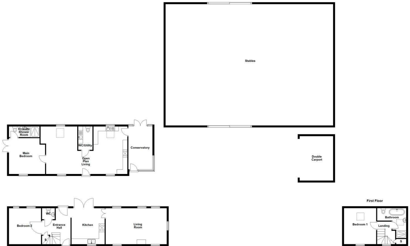
The Barns, Firwood Farm