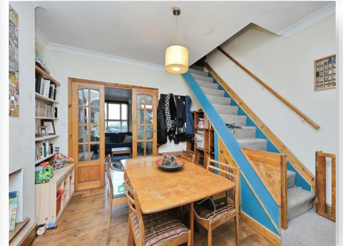
Churchill Road, Norwich, NR3 4PX