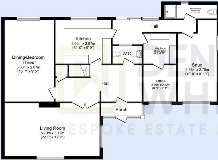
Ground Floor Floor area 117.9 sq.m. (1,269 sq.ft.)