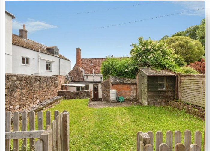
Church Street, Dunster, Minehead, TA24 6SH