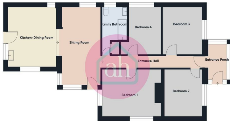
Ground Floor Building 1