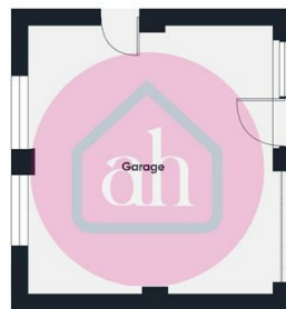
Ground Floor Building 2