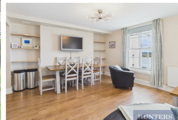
Agnes Grey House, 133 - 135 Castle Road, , Scarborough, North